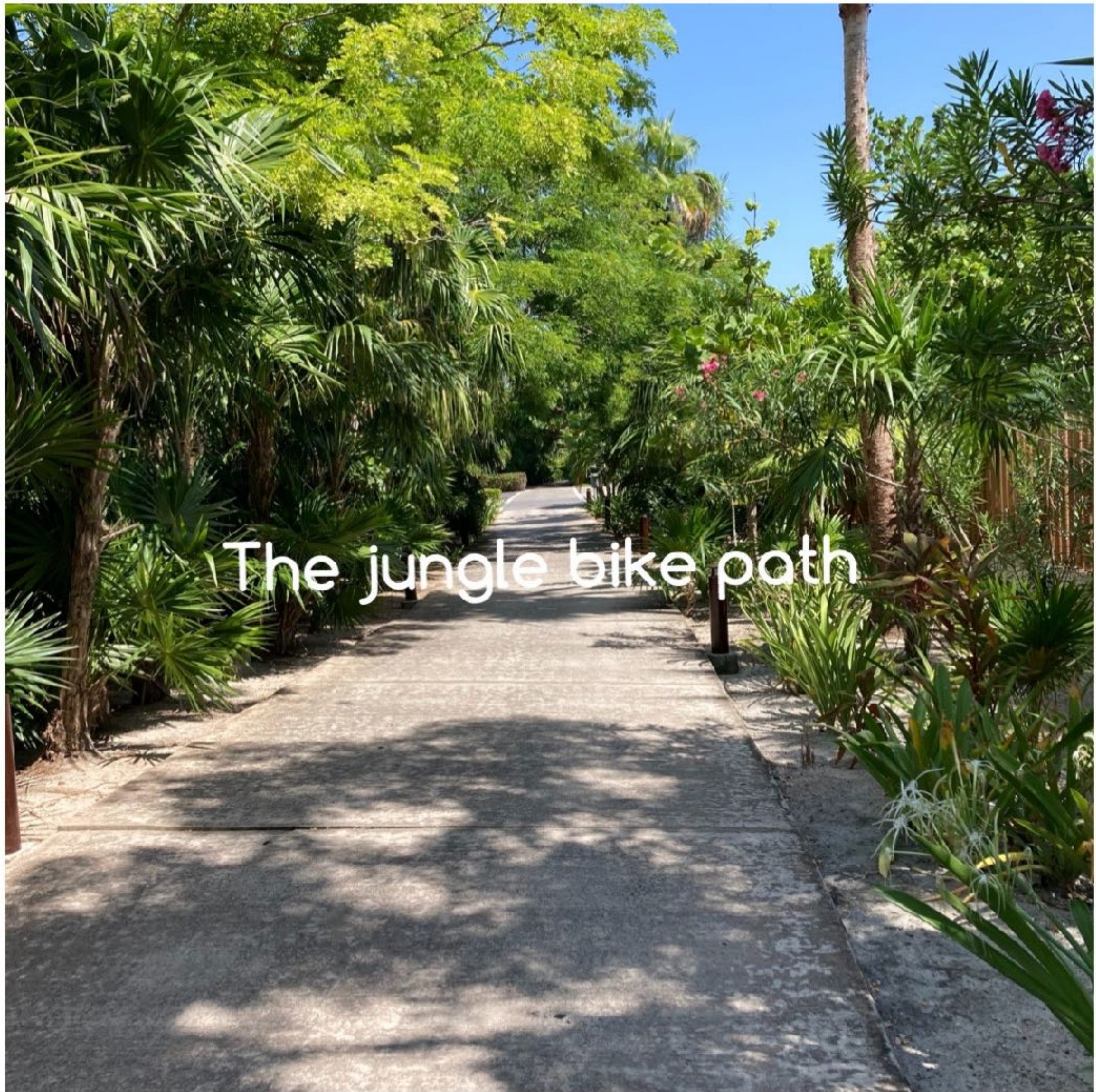
The jungle bike path