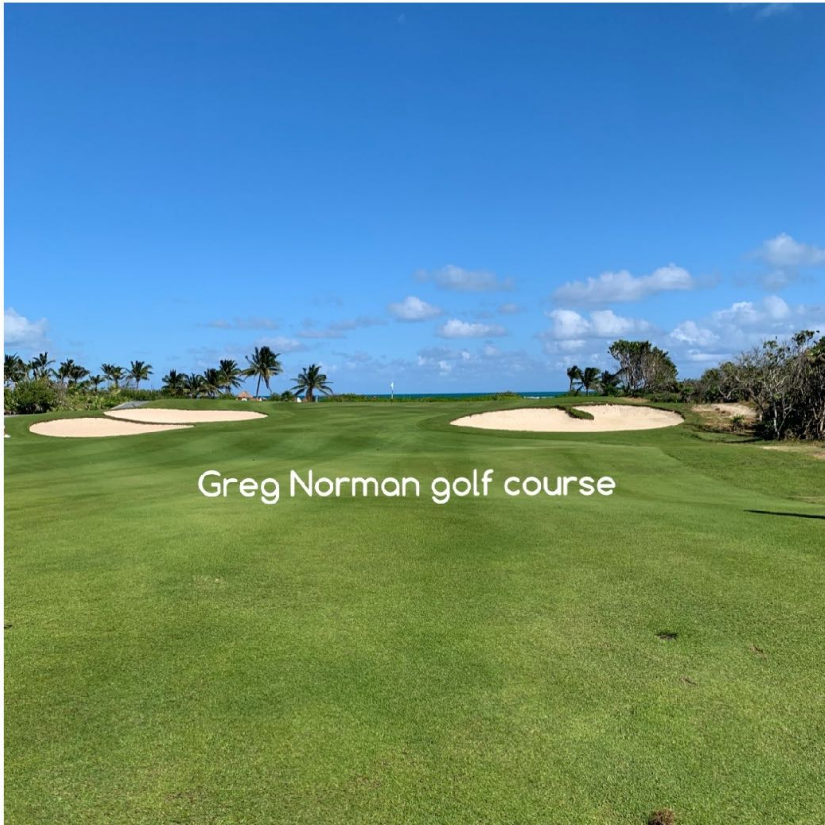
Greg Norman golf course